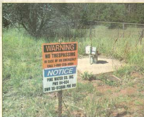
No Fence, No Security