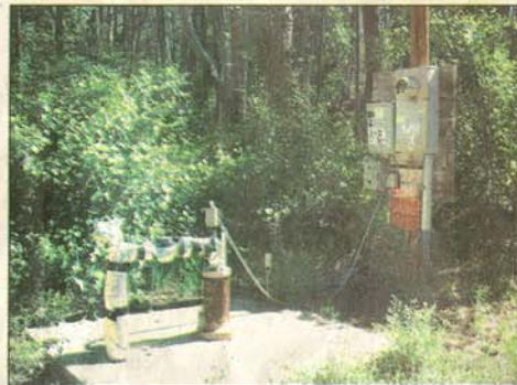
No Fence, No Locks, Wiring to Code?